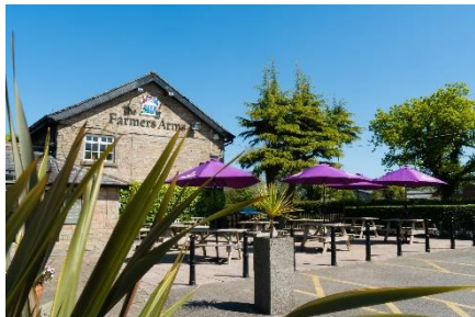
The Farmers Arms Chorley Rd, Bispham L40 3SL 01257 464640

The Parish Council meets on Thursdays. The dates in 2017 are: 5 th July, 6 th September, 1 st November. The meetings start at 7:00 pm. There is a 15 minute Public Forum so if there's something on your mind, go along to a Council meeting and speak to the Councillors. -----